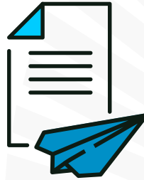
Mixed Office Paper